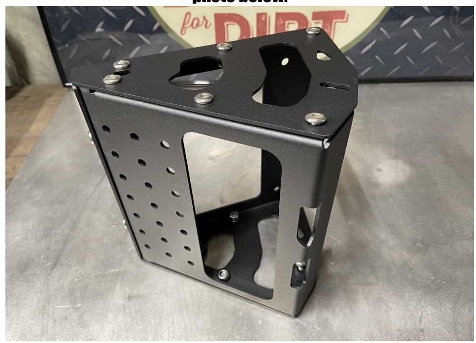
Then loosely attach the side pieces to the main basket.

Using the provided harware loosely assembly the two side pieces as show in the photo below.